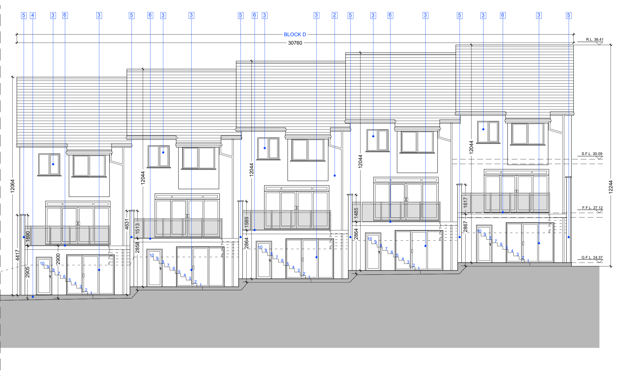
PROPOSED WEST ELEVATION 1:100@A1