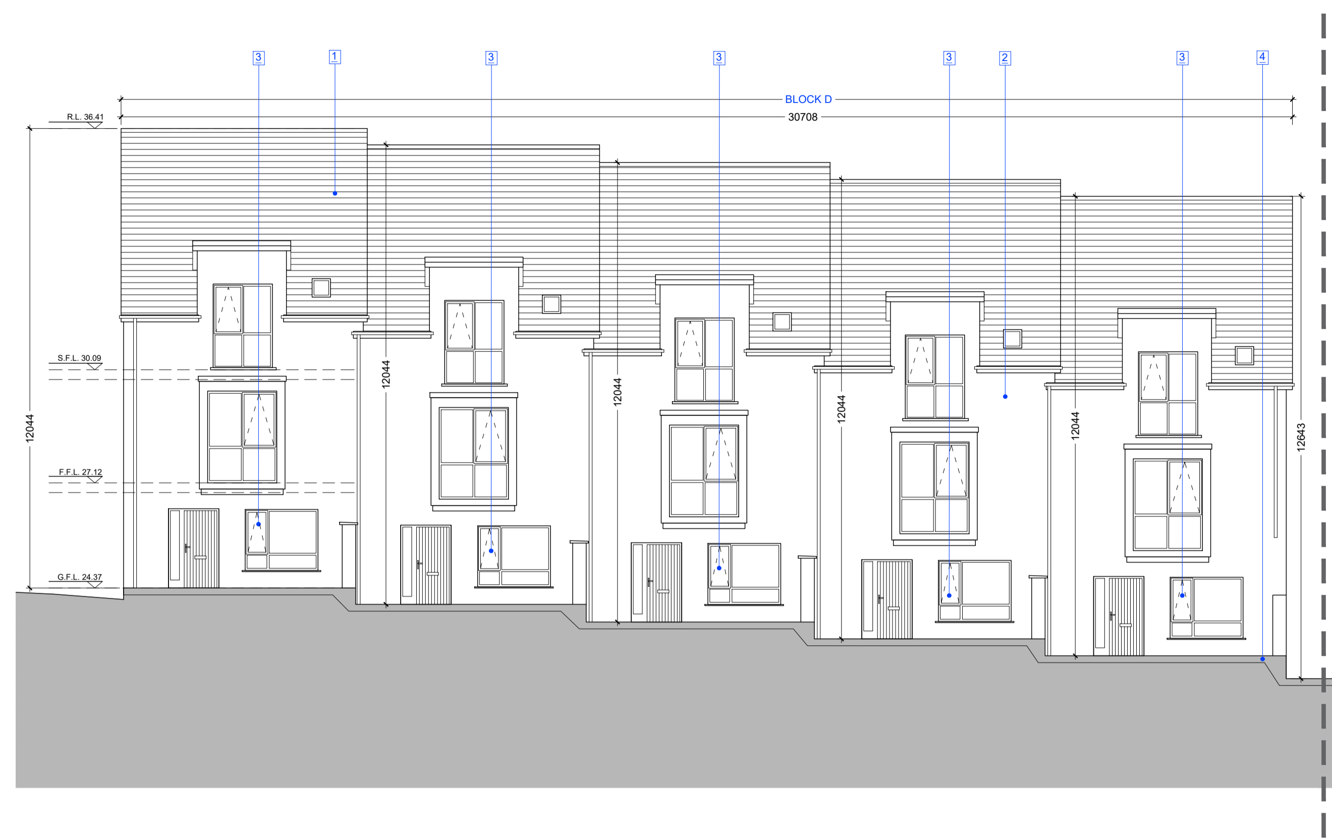
PROPOSED EAST ELEVATION 1:100@A1